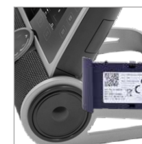
WLAN/Bluetooth module included