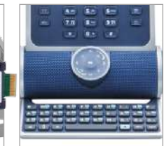
Alphabetic keyboard option