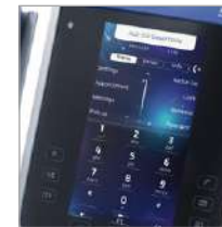
100% Touch experience