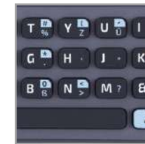
Alphabetic keyboard option