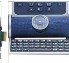
Alphabetic keyboard option