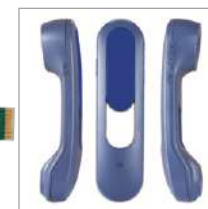
Cordless handset option