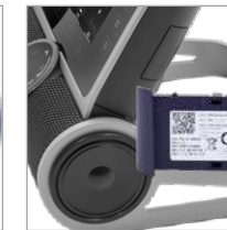
WLAN/Bluetooth module included