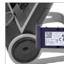
WLAN/Bluetooth module option