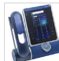
100% Touch experience