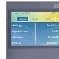
Large colour display