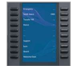
Key expansion module option