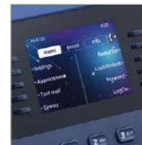
Large colour display