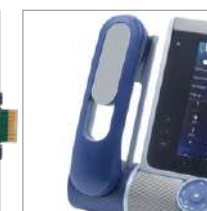
Bluetooth handset option